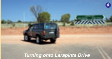
Turning onto Larapinta Drive