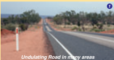
Undulating Road in many areas