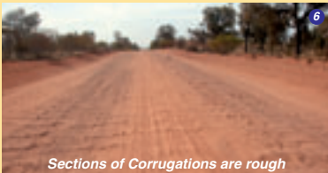
Sections of Corrugations are rough