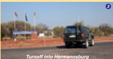
Turnoff into Hermannsburg