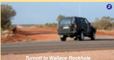
Turnoff to Wallace Rockhole