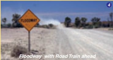
Floodway with Road Train ahead