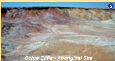
Ochre Cliffs - Aboriginal Site