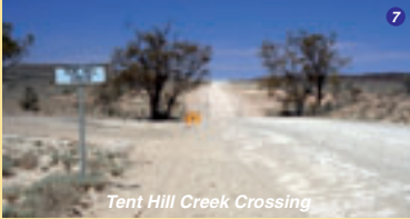
Tent Hill Creek Crossing