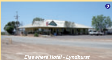
Elsewhere Hotel - Lyndhurst