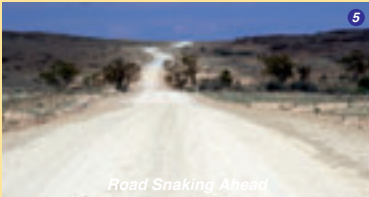
Road Snaking Ahead