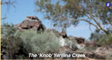
The 'Knob' Yerilina Creek