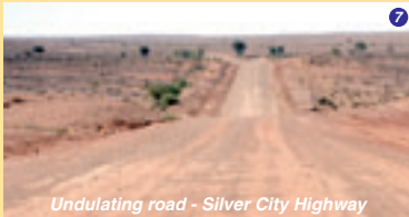
Undulating road - Silver City Highway