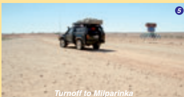
Turnoff to Milparinka