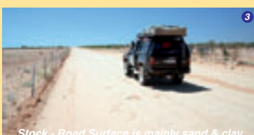
Stock - Road Surface is mainly sand & clay