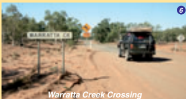
Warratta Creek Crossing