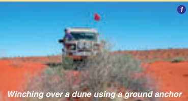
Winching over a dune using a ground anchor