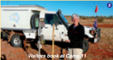
Visitors book at Camp 11