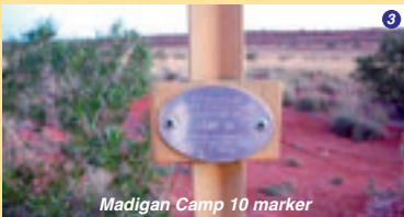
Madigan Camp 10 marker