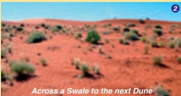
Across a Swale to the next Dune