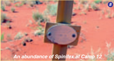
An abundance of Spinifex at Camp 12