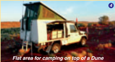
Flat area for camping on top of a Dune