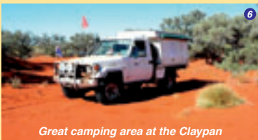
Great camping area at the Claypan