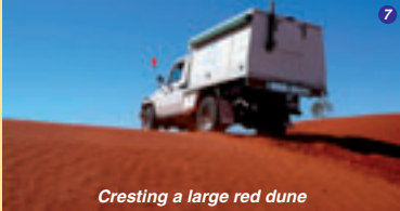
Cresting a large red dune