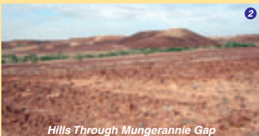
Hills Through Mungerannie Gap