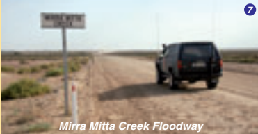
Mirra Mitta Creek Floodway