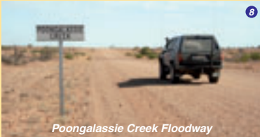
Poongalassie Creek Floodway