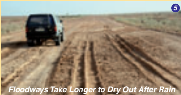
Floodways Take Longer to Dry Out After Rain