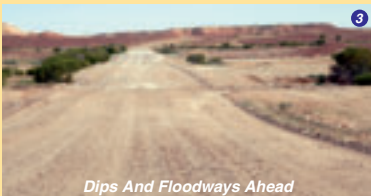
Dips And Floodways Ahead